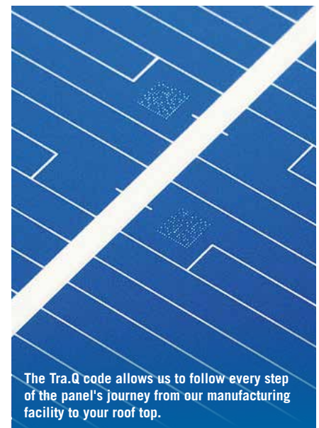
The Tra.Q code allows us to follow every step of the panel's journey from our manufacturing facility to your roof top.

tests and ensures that your solar panel will not only perform well for its rated lifetime, but operate reliably and safely.